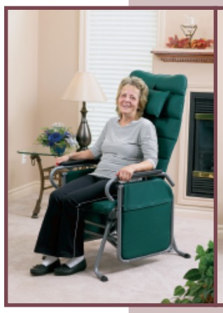
Excellent for Alzheimer's residents

Caregiver lock prevents unwanted gliding