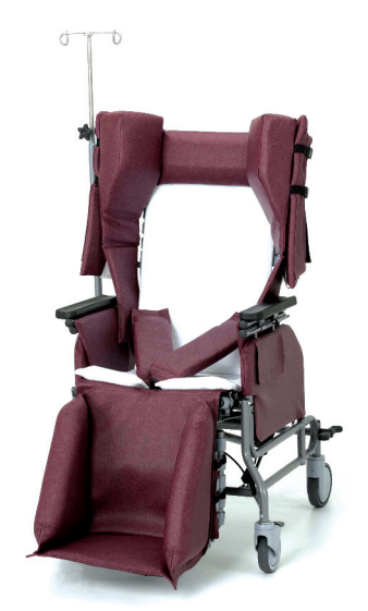
785 with Huntington's Padding (HSP) and IV Pole