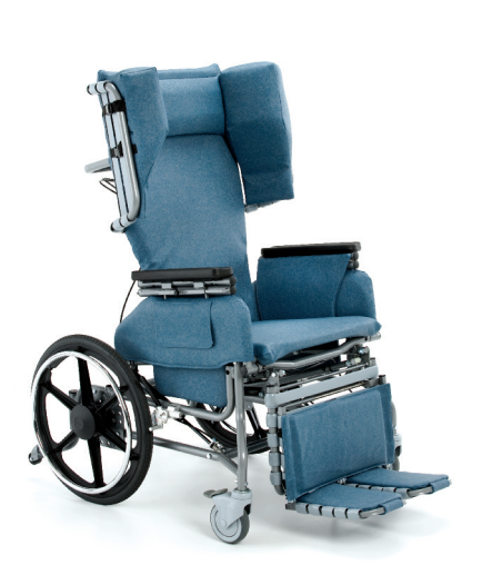
785 with full vinyl covers and mag wheels