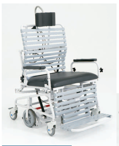
Optional Transport Seat