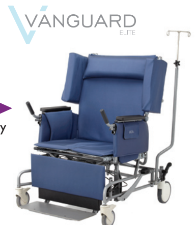
Vanguard Elite with IV pole and vinyl seat and back pad upgrade.

Broda chairs feature infinitely adjustable tilt-in-space to allow for an infinite range of positioning options for optimal comfort, safety and repositioning.