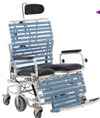
Bari 385 with optional headrest