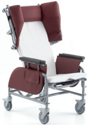
Pedal Chair with full padding upgrade