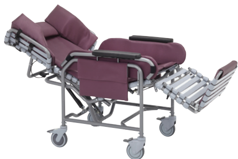
30Vt with vinyl seat and back pad upgrade