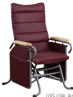
100-10AL Adult Small Glider with optional wooden arms