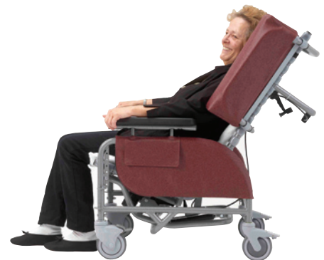
Pedal Rocker with full padding upgrade