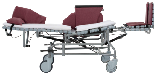
785 Tilt Recliner