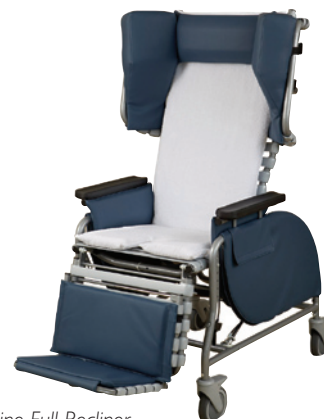
Midline Full Recliner