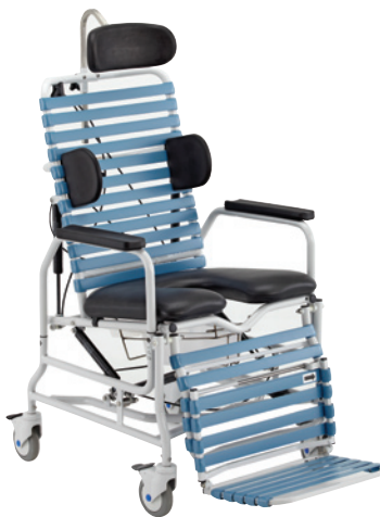
CS 385 with optional headrest and laterals