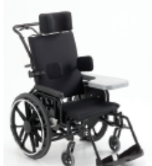
Excellent for fall prevention