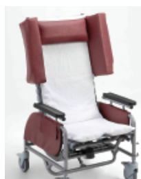
Excellent for Alzheimer's