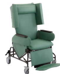
Ideal for multiple users and hospital environments