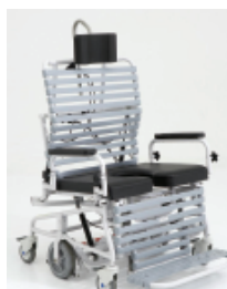
Available with transport seat