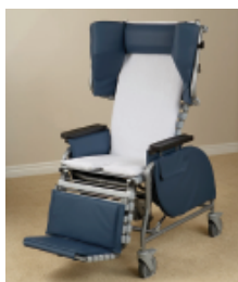
Multi-positioning on a budget