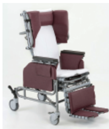
Excellent for your most difficult to seat residents